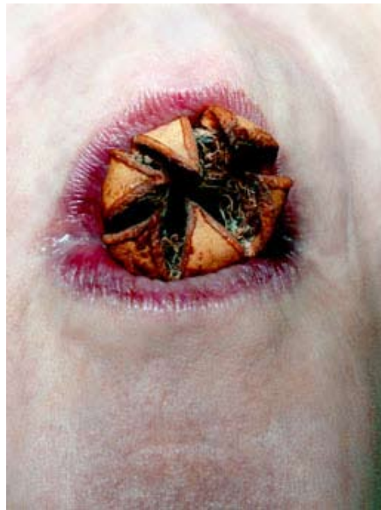
Naida Osline, Untitled body images , 22 x 18 inches, 2007